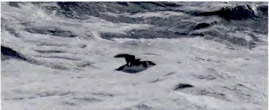
Figure H. Northern Gannet (top). Common Murre (middle). Dovekie (bottom). Hudson Valley Shelf, 10 Feb 2007